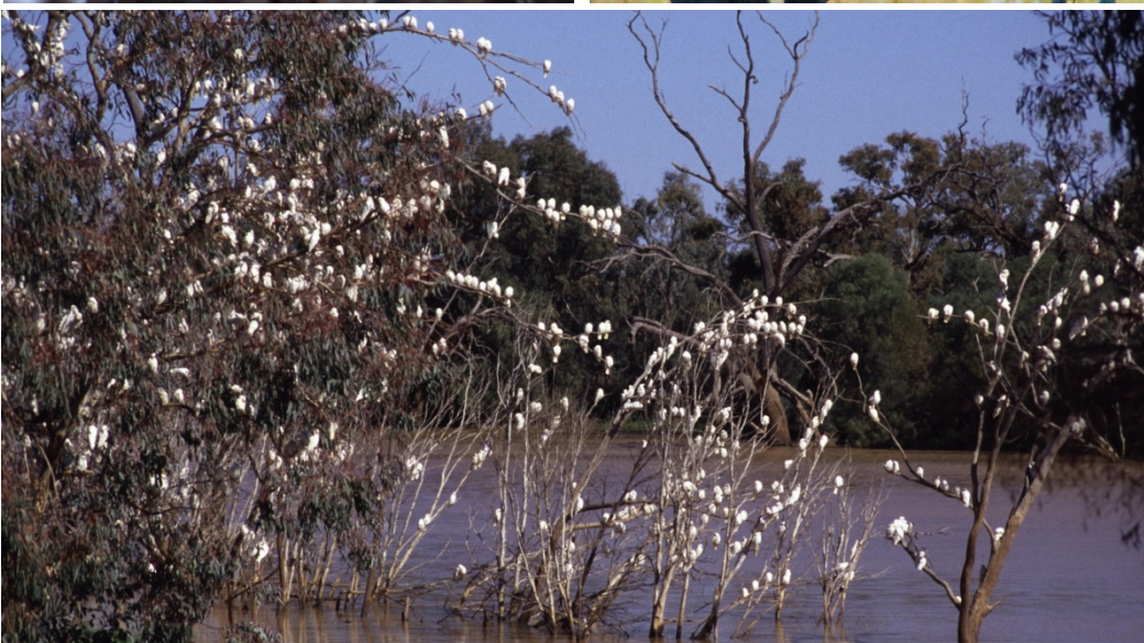
Long-billed Corella (top); Little Corella (centre, left; bottom); Major Mitchell's Cockatoo (centre, right).