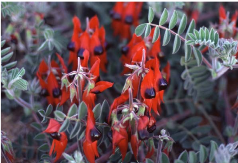
"Drive-through cinema" and Sturt's Desert Pea at Tibooburra (above).

25 July Travelling to Broken Hill - 300 km of partially sealed road, where we arrived at lunch time. Then 140 km drive to Wentworth, where the Murray and Darling Rivers meet each other (each being > 2 500 km long). After a good hamburger, we travelled to Hattah Kulkygne NP. A very nice campground, Yellow Rosella and a warm fire.